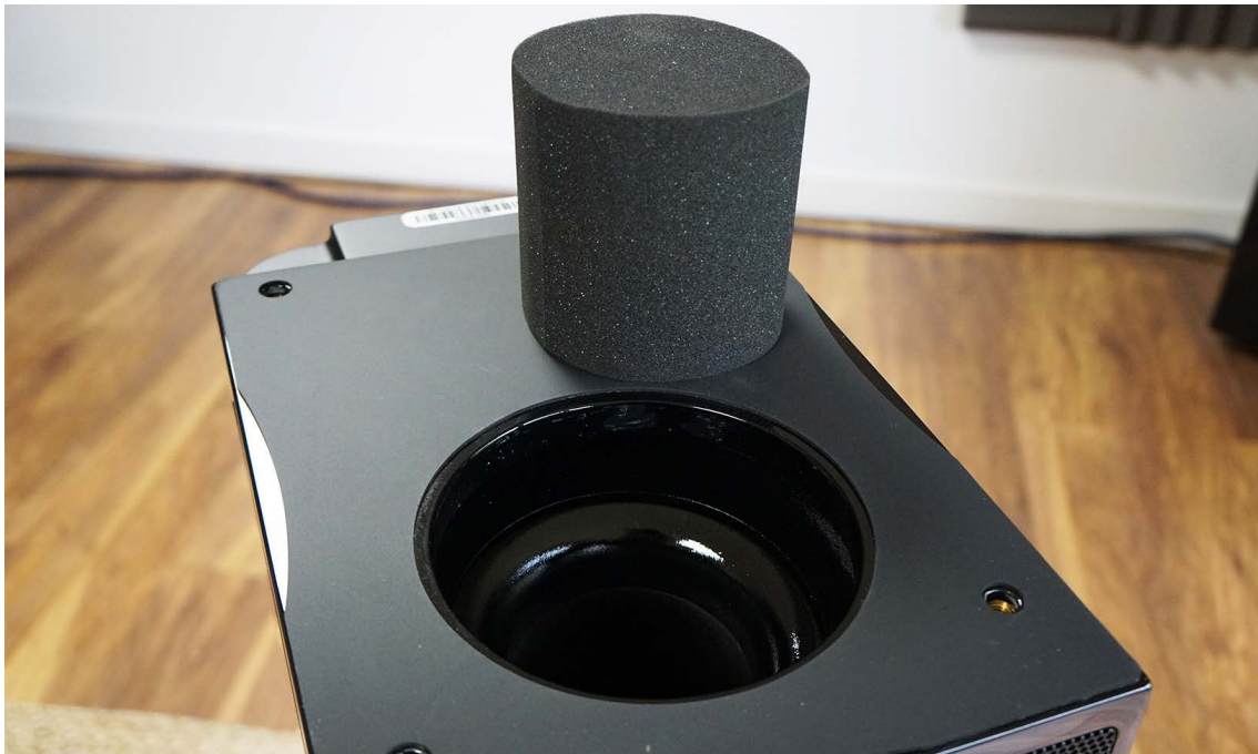
R5t's down-firing bass port with optional foam bung

Experimenting with the bung requires some heavy lifting though, as you need to turn each speaker upside down and install it before fitting the outrigger support plate, so while A-B testing can't be done on the fly, it's still worth experimenting to find the ideal set up for a given space.