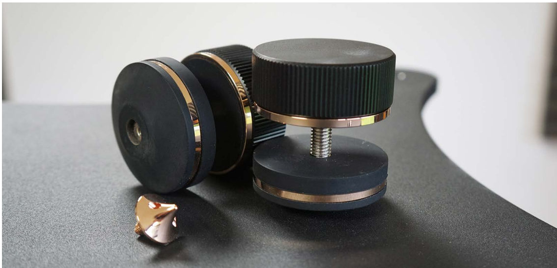
No spanners required, the R5t's feet with copper details add a dash of glitz while also aiding stability and offering easy adjustment

Continuing the quality components, the adjustable bolt through feet with copper xfbasstrimmings are a joy to use and offer large domed rubber pads with optional spiked tips to cater for a variety of floor surfaces.