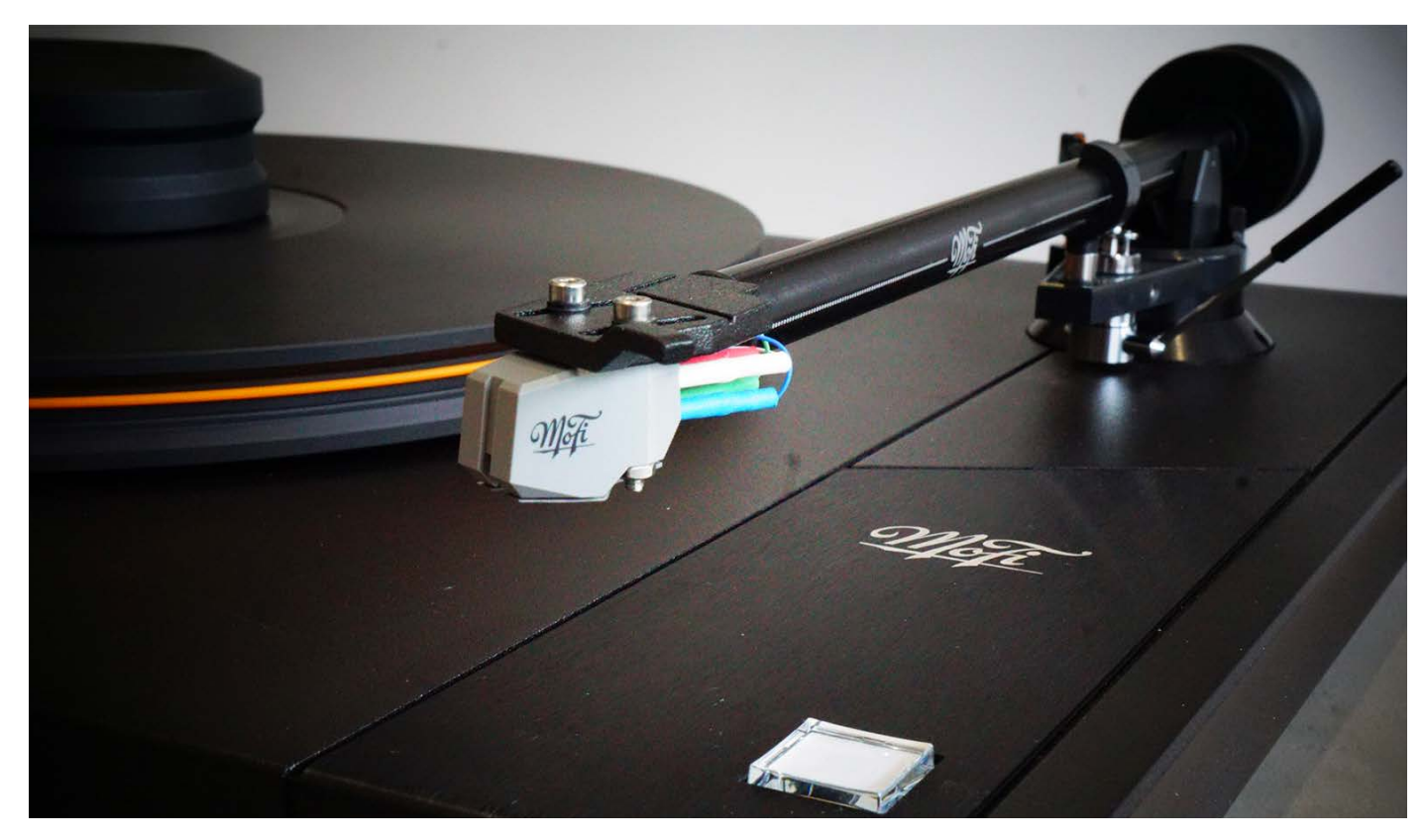
MoFi StudioTracker cartridge is a dual moving-magnet design that's made in Japan. It costs £199 on its own and offers 3.5mV output with 100pF capacitance

Hearing the title track Cornflake Girl 's infectious opening ringing guitars followed by the pure scale of the piano chords that follow is arresting stuff. Maybe it's the dense platter, or the dual magnets in the cartridge, but either way if I'd not unpacked this deck myself I'd presume the music was being served up by a high mass machine of Germanic origin that needs three well fed blokes to install it, such is its dense texture. Add to this the MoFi's sense of energy and detail that typically low mass decks can command with ease and the StudioDeck + makes for a very convincing all round package.