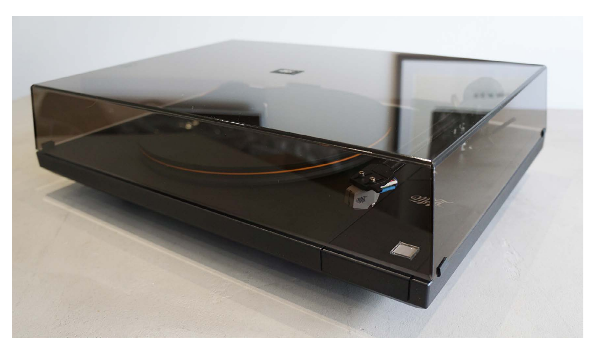
Smoke coloured dust cover adds a nice retro vibe while protecting the deck

The StudioDeck is the cheaper model of two turntables MoFi offers, sitting below its UltraDeck which sports a thicker platter, more refined plinth and upgraded tonearm wire, with prices starting at £2,499.