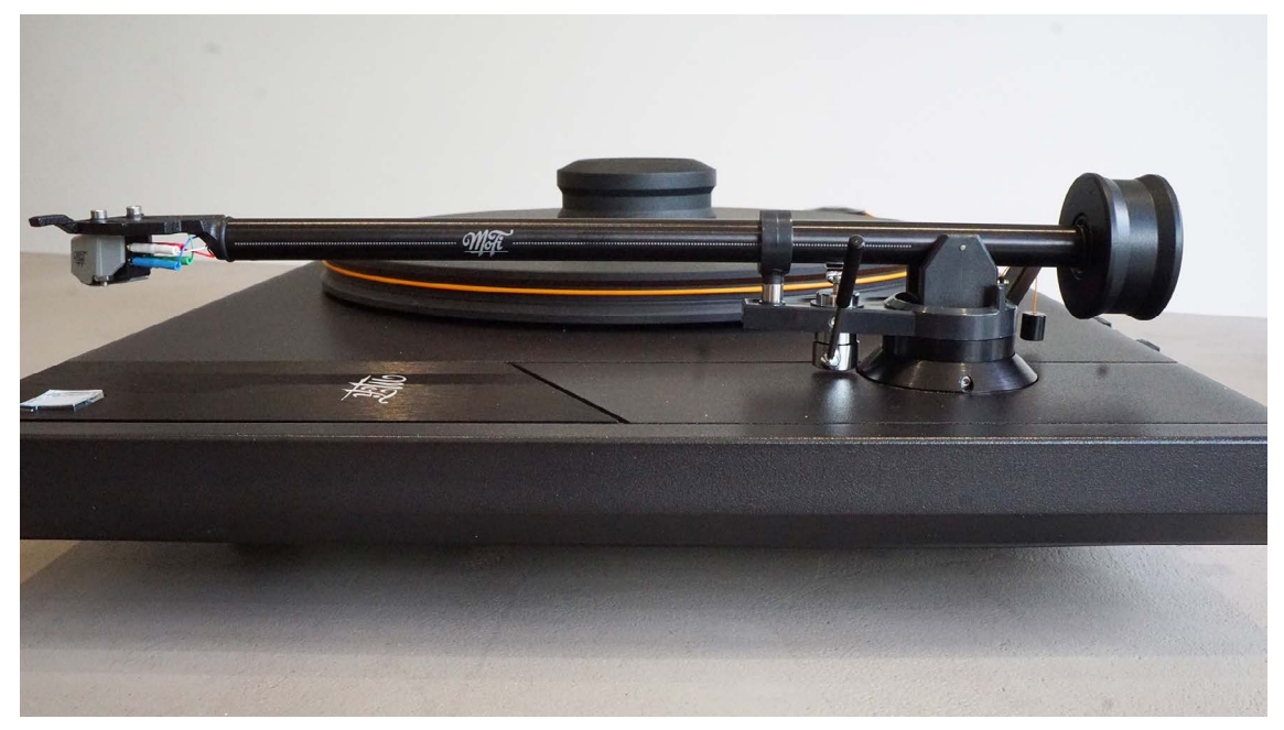
USA made 10" straight wand alloy tonearm is MoFi's own and offers plenty of adjustment to take a range of cartridges

Completing the rig is MoFi's StudioTracker moving-magnet cartridge, which sports an elliptical stylus and dual-magnets in a V-twin formation inside its polymer body.