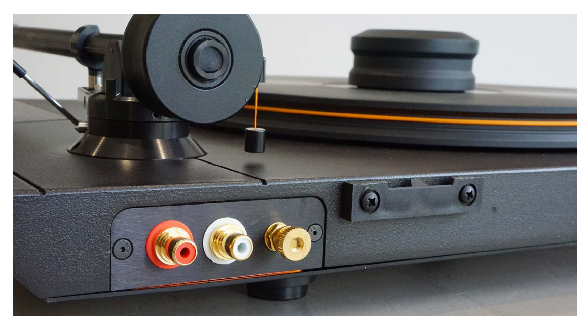
Armwires are terminated via well made RCAs, so you can add cables of your choosing to connect the StudioDeck + up to your system. Note the soft material in the end of the arm wand to aid damping

Justin Rutledge's defining 2010 LP The Early Widows on Six Shooter Records is a gem of a no-compromise recording with an exquisite sound (as legend has it, the vinyl mastering engineer refused more than four tracks per side to avoid compromising the vinyl grooves' proximity, which is why the digital album is two tracks longer) and aboard the StudioDeck + you get why. Tracks including Jack Of Diamonds has the MoFi walking a finely trodden line between balanced and detailed without straying into over engineered territory, pulling out layers of finesse, from the slide guitar to the backing singer's lilting edges that shows how accomplished this recording, and the deck's presentation is. On lesser players this album still sounds better than average, but you don't get the full treatment that really does it justice, which the MoFi seems to revel in.