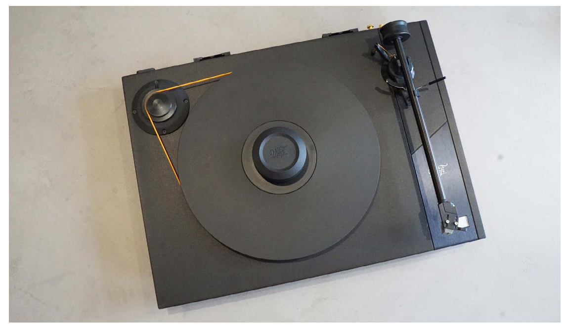
The StudioDeck's purposeful looks reveal its pro heritage and the 10" tonearm ensures generous plinth dimensions at 500mm by 362mm wide/deep

Thankfully what MoFi has not done is simply tweak and rebadge one of its industry stablemates' decks, preferring to create its own design from the ground up, recruiting Allen Perkins of Spiral Groove fame as lead engineer. And this is an approach we've seen before from MoFi, with its phono stages designed by the much missed audio guru Tim de Paravicini and new SourcePoint loudspeakers from the pen of industry legend Andrew Jones, previously of ELAC, TAD and KEF fame.