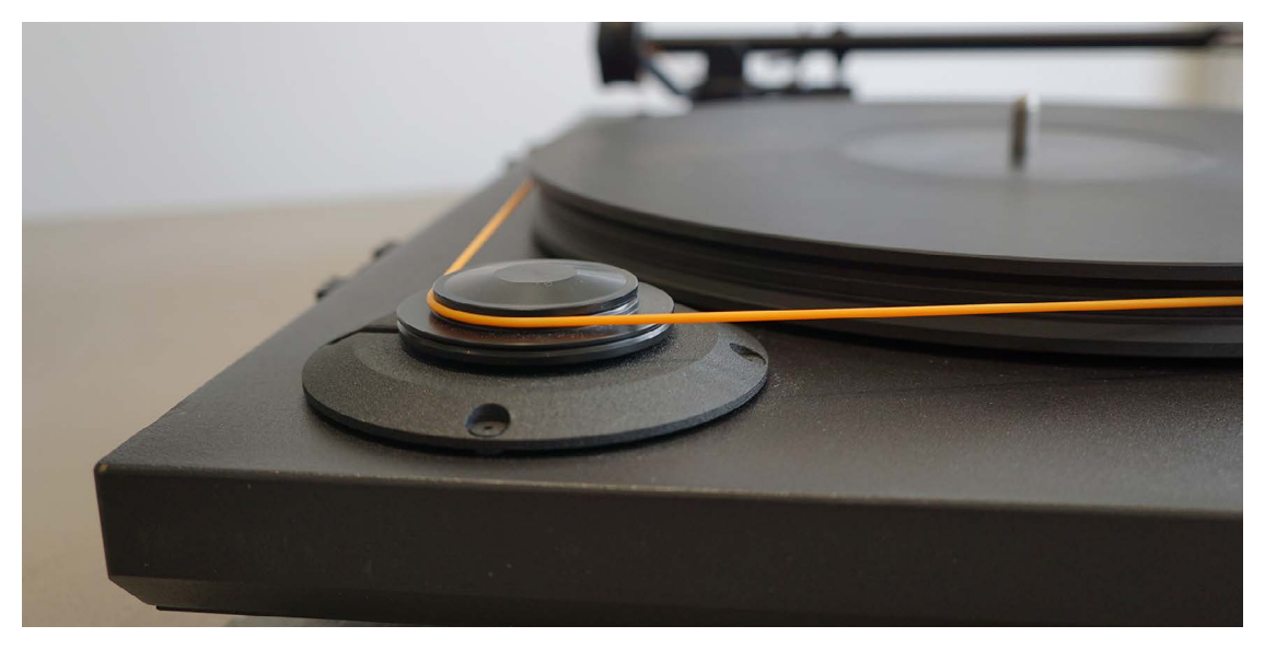
AC motor mounted at the 10 o'clock position with stepped pulleys for 33/45rpm

The StudioDeck's 10in gimbaled bearing tonearm features an alloy armwand and is also carried over from the UltraDeck, but with oxygen free copper wiring instead of the latter's Cardas cable. While looking deceptively simple, it provides adjustment for VTA and azimuth alongside the usual anti-skate and tracking force, although thankfully the former two are factory set, leading to an easy set up.