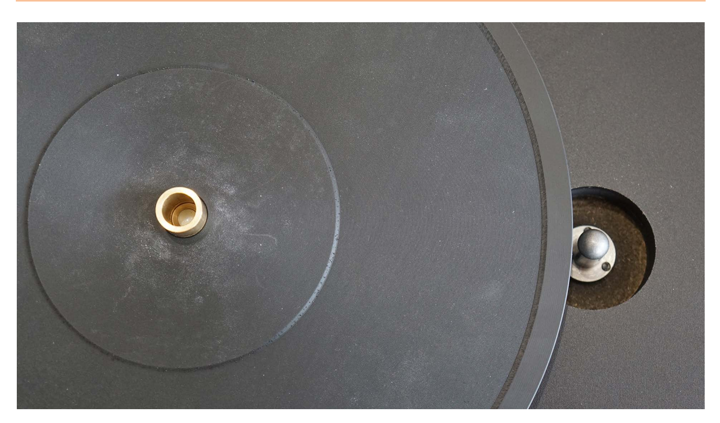
The underside of the StudioDeck's Delrin platter (left) showing its bronze sleeve with teflon thrust plate bearing that rotates around the fixed large steel pin in the plinth (right)

The platter is driven via a funky orange rubber belt that passes around its periphery and stepped motor pulleys (for 33 and 45rpm) from a 300RPM AC synchronous Hurst unit, that's isolated within the plinth. Like the platter bearing, this also looks more heavy duty than most thanks to the generous sizes of the pulleys, allowing for plenty of grip.