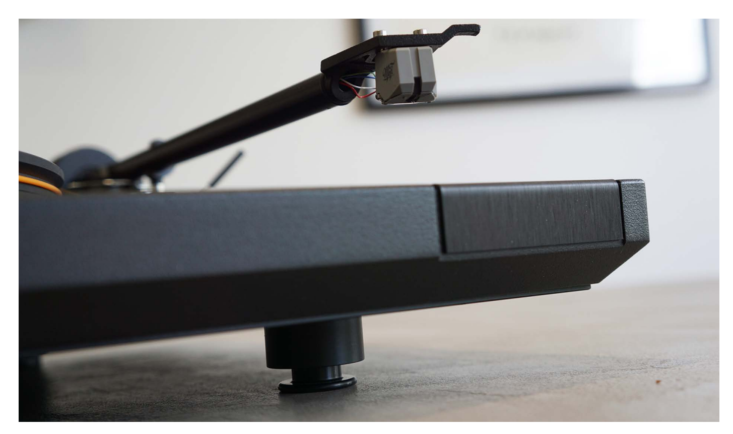
Four sprung feet help to isolate the deck from external vibrations. The rear feet have thicker pads, accounting for the extra mass at the deck's rear

Midnight Rambler with its marching percussion and closing crescendos comes across as just as menacing and tension laden as it would have some five plus decades ago, again revealing how the StudioDeck + really gets into the music. One caveat though is the clamp. In my opinion it's essential and perhaps should be part of the package as standard, such are the benefits it brings. Aside from providing a more solid and reassuring connection to the StudioDeck's platter, it also adds a greater sense of body and grip to the music. It's finite, but it's there, and these greater dynamics (which the deck already has in measures beyond many of its rivals) alongside curbing a little of the background noise makes it a worthwhile reason to dig a little deeper into your hard earned.