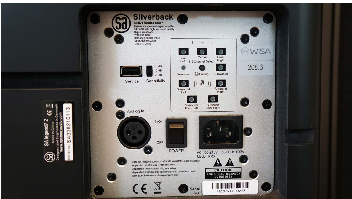
SA Legend's rear panel controls includes a balanced analogue input and power. The speaker's position is selected from eight options (boxed out section) using the central pairing button. There are also three sensitivity settings for -6dB/0dB/+6dB

To save drilling my freshly plastered 7x4m listening room, I mounted the speakers on stands with their rear panels flush to the wall, positioned horizontally, 1.8m apart and firing down the longer axis.