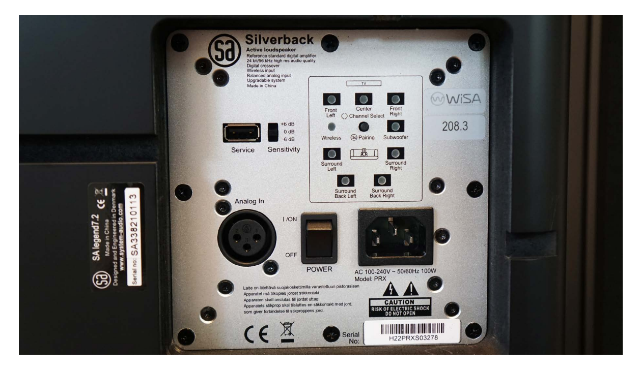
SA Legend's rear panel controls includes a balanced analogue input and power. The speaker's position is selected from eight options (boxed out section) using the central pairing button. There are also three sensitivity settings for -6dB/OdB/+6dB

To save drilling my freshly plastered 7x4m listening room, I mounted the speakers on stands with their rear panels flush to the wall, positioned horizontally, 1.8m apart and firing down the longer axis.