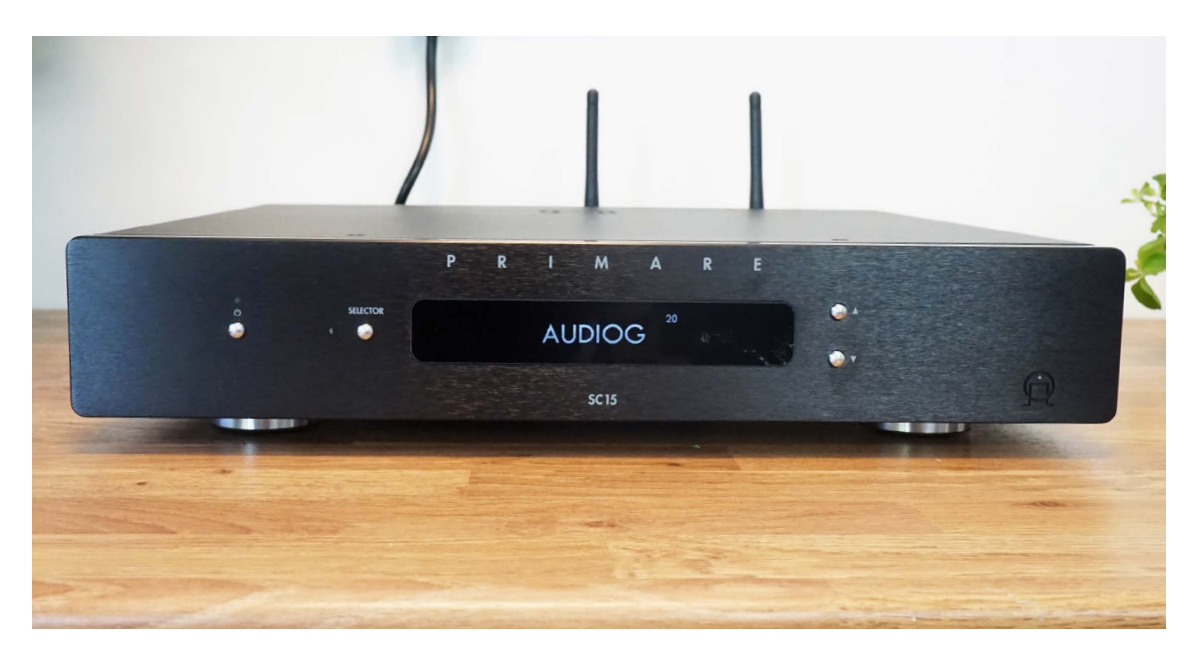
Minimal front panel controls for standby, selection and menu plus elegant customisable screen are pure Scandi minimalist