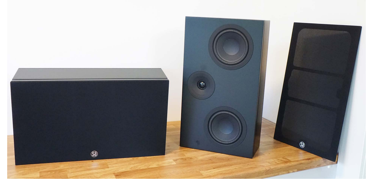
Versatility is the name of the Legend's game, as they can be mounted vertically or horizontally on walls, shelves or even ceilings, with alternate grilles included to match

The speakers' twin 5.5in (140mm) mid/bass units are formed from carbon fibre membranes while the accompanying 1in (25mm) tweeter is a soft dome type, that's recessed within a chamfered DXT acoustic lens to provide more even high frequency distribution across a listening environment.