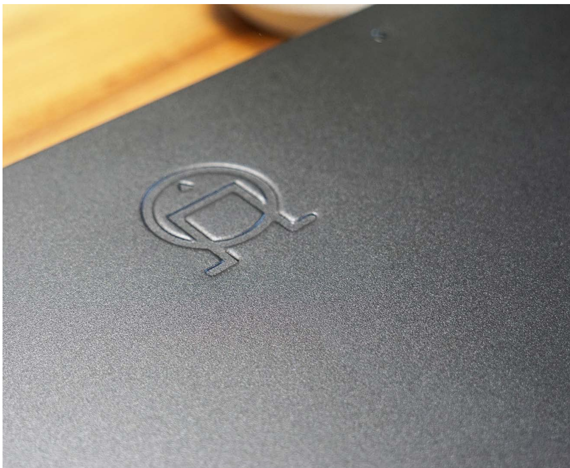
There's no mistaking Primare's logo

What the older R32 did so well and the R35 improves upon is marrying a delightfully analogue richness across the midrange and treble with precision and control in the lower frequencies. With many preamps, there can be a trade off as too much authority low down can starve other elements of emotion, while the richer emotional presentations of other rivals comes with a little too much bloom in the bass regions. The Primare however stands out as a master of both elements.