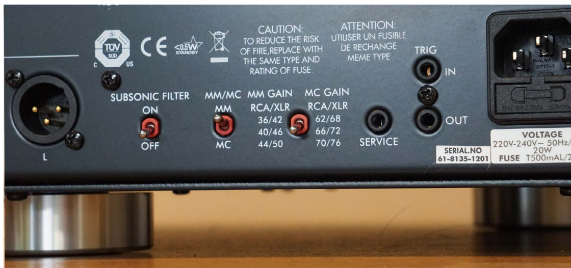
Cartridge type, gain and subsonic filter can all be selected from clearly labelled toggle switches

A subsonic filter with improved circuitry completes the spec sheet.