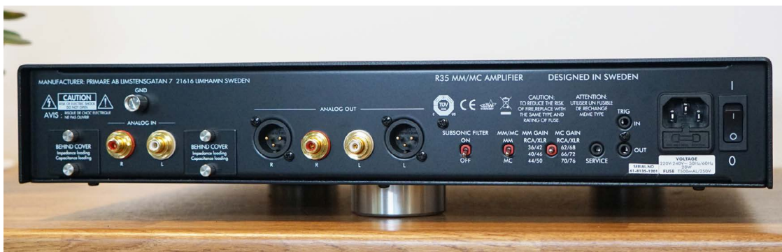
Rear panel boasts top quality and well spaced connections, including line-level (RCA) and balanced (XLR) outputs

For moving-magnet (MM) pick-ups you get options for 42/46/50dB and 68/72/76dB for moving-coil (MC) over XLR, compared to 36/40/44dB for MM and 62/66/70dB for MC over RCA, giving you twelve options in total.