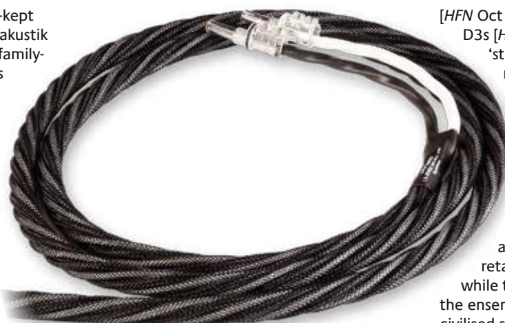
ABOVE: Fitted with a choice of rhodium-plated plugs, the LS-204 XL Micro Air combines physical flexibility with a design that supports long runs

In-akustik set out to design a low inductance cable and in the LS-204 XL it has undoubtedly succeeded – the mere 0.23µH/m imposed here being